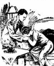
"I CAN'T GO ON!"

For four days after that the men journeyed to the headquarters of the chieftain, who welcomed them warmly and later, motored them back to the squadron with a body-guard.